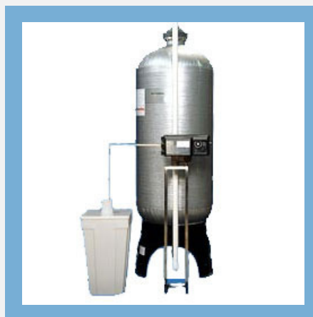
Domestic Water Softening Plant