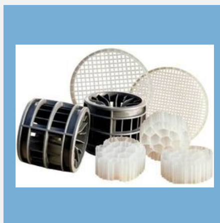
Moving Bed Biofilm Reactor