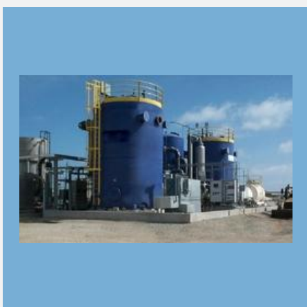
Fluidized Aerobic Bed Reactor