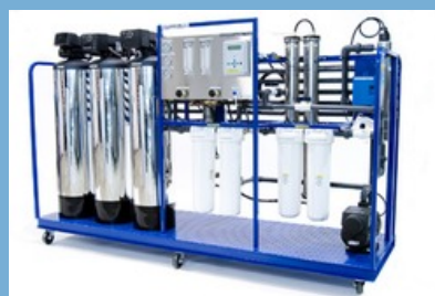
Reverse Osmosis Plant