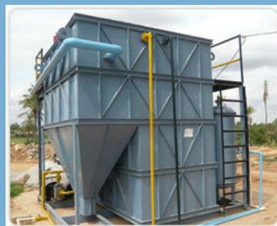
Skid Mounted Sewage Treatment Plant