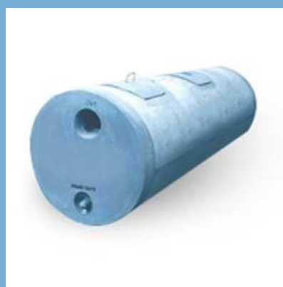
RCC Sewage Treatment Plant