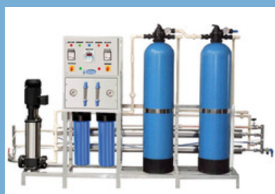
Water Softening Plant

Pioneer in the industry, we are engaged in offering Water Treatment Plant . Only high quality components are used while fabricating the offered plant, for increased compliance with industry standards of quality. This plant is highly appreciated among clients for its excellent performance and low maintenance cost.