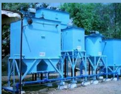
Fabricated Sewage Treatment Plant