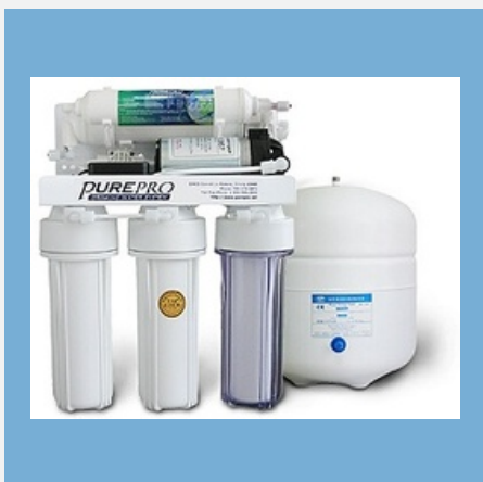
Domestic RO Plant